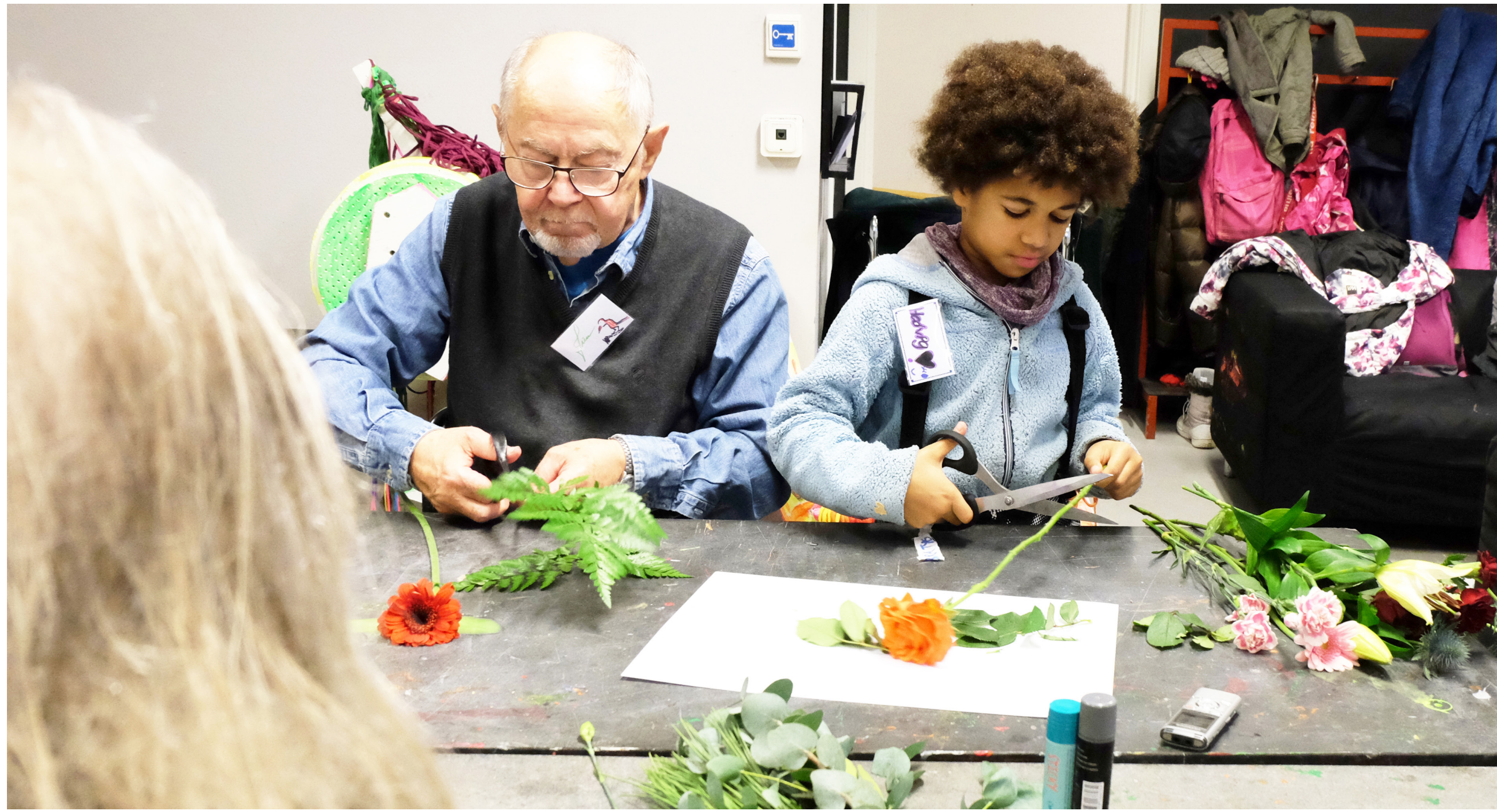
Elderly and children working together to create a collage of flowers that expresses feelings of sorrow and loss.